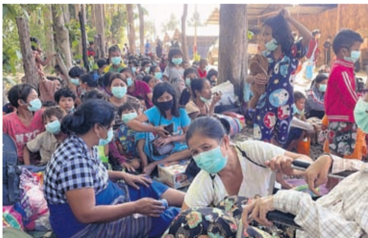
Myanmar villagers rest in an evacuation area after fleeing to Thailand following clashes between Myanmar troops and an ethnic Karen rebel group Friday, Dec. 17, 2021, in Mae Tao, Tak province, northern Thailand.